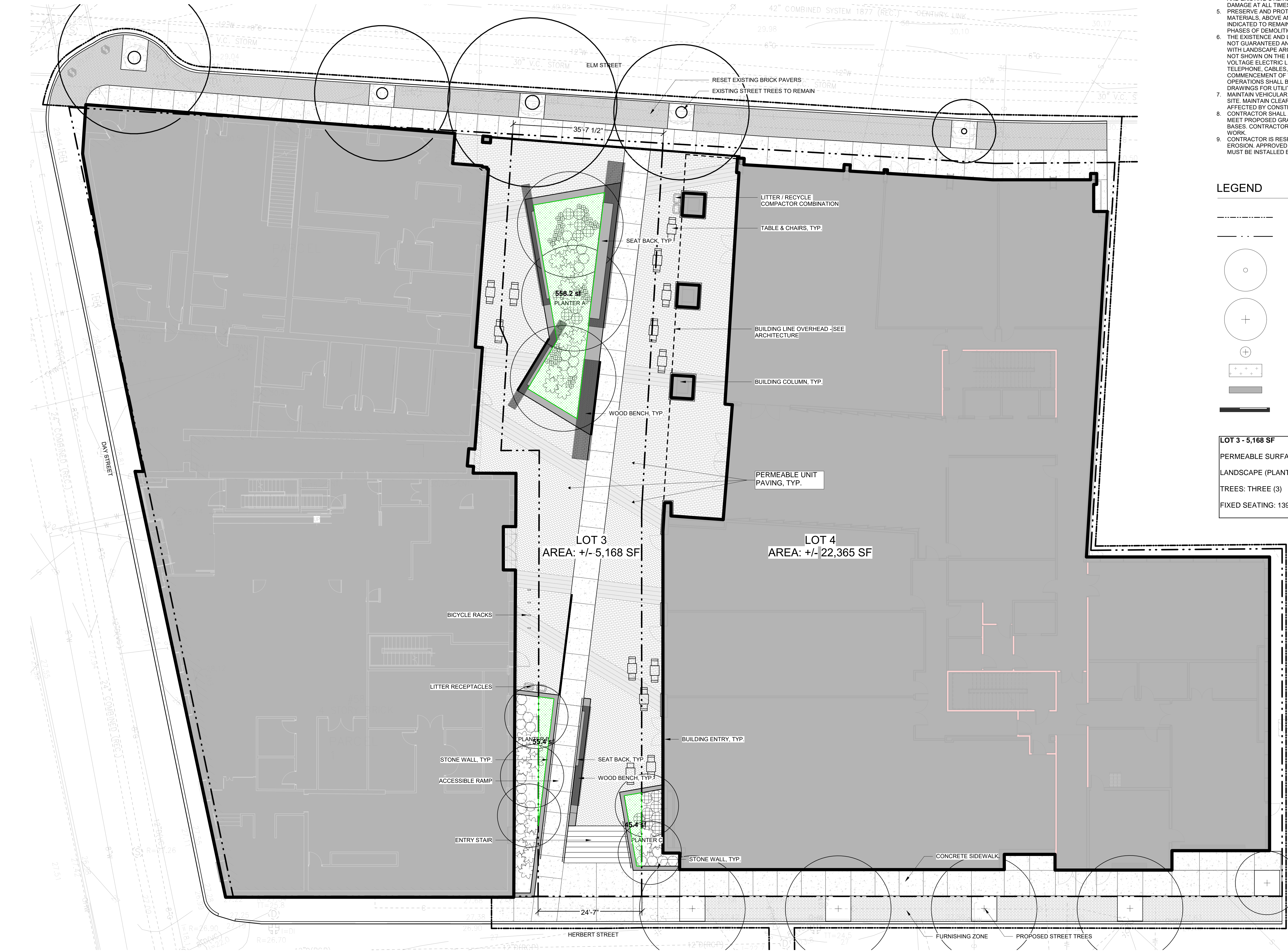
1 LAYOUT PLAN 1" = 10'-0"

LOT 3 - 5,168 SF PERMEABLE SURFACE AREA: 2,670 SF LANDSCAPE (PLANTED) AREA: 659 SF TREES: THREE (3) FIXED SEATING: 139 LF (72 LF W/ BACKREST)